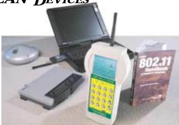
2. Pictured here is Berkeley Varitronics' (Metuchen, NJ) IEEE 802.11 WLAN Grasshopper product. This handheld receiver measures signal strength, bit-error rates (BERs), and even shows multipath energy. Additionally, it provides real-time display of key parameters to enable installers to optimize placement of nodes and identify sources of interference.